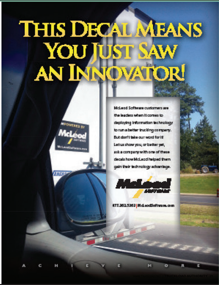
28 TRUCKLOAD AUTHORITY | www.Truckload.com TCA 2018

LET'S SHIFT TO SOME INDUSTRY ISSUES. YOU HAD A BANNER YEAR FOR MOST CARRIERS IN TERMS OF GOOD RATES, RATES AND OPERATIONAL EFFICIENCY. HOW DO YOU EXPECT THIS TYPE OF ENVIRONMENT TO CONTINUE? The current economic conditions, as well as stress on capacity in our industry, have proven to be a positive environment. There are several issues that may affect the current conditions such as tariffs, regulations and modern elections. Financing will also be a factor. I would think that we have two years or so of this current environment.