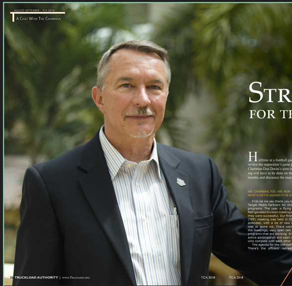
28 TRUCKLOAD AUTHORITY | www.Truckload.com TCA 2018

Company name and website prominently displayed at the top of each left hand read page in section/feature