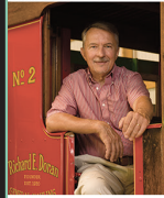
28 TRUCKLOAD AUTHORITY | www.Truckload.com TCA 2018